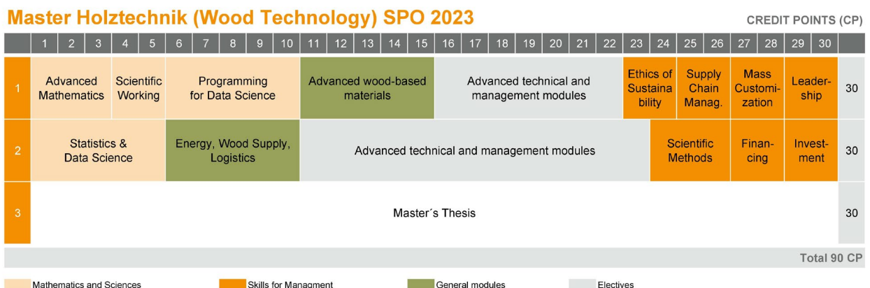
Fig. 2: Schematic representation of the detailed Programme structure