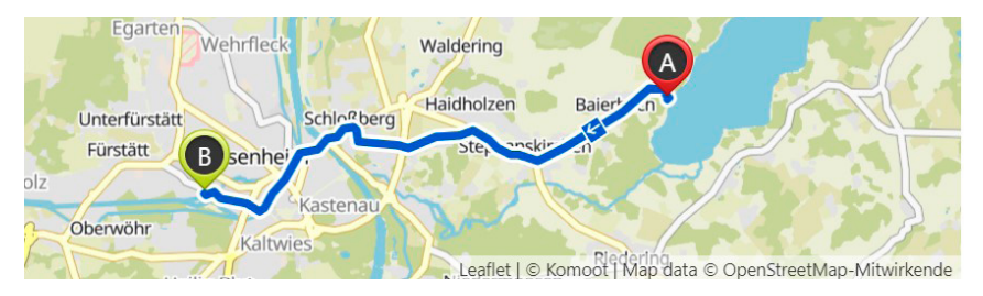
>> www.komoot.com (Route)