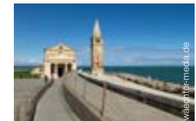
11 Italy's Adriatic Coast Just 4 hours to the Adriatic Coast, there isn't a faster route from Germany