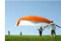
7 Hochries Paragliding, mountain biking, cabin charm and much more