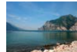
10 Lake Garda Windsurfing and la dolce vita in the heart of Italy in just 3 hours