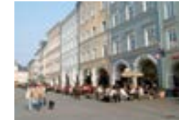
1 Rosenheim Mediterranean flair in the town centre with numerous cafés and bars