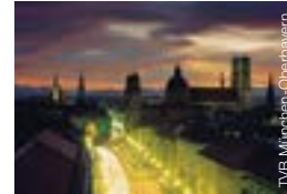
6 Munich Big city flair – just a 30-minute train ride away