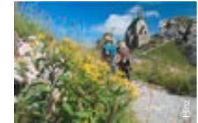
2 Wendelstein Hiking and cave tours – stunning mountain with an impressive view