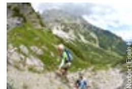
9 Kaisergebirge Climbing, skiing, canyoning etc. in just 30 – 45 minutes