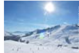
3 Sudelfeld Ski Resort From your lecture to the slopes in only 30 minutes