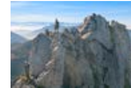
4 Kampenwand 1,669m high, triple-peaked rock formations with a view of the Chiemgau