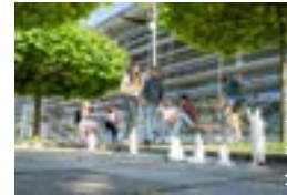
1 Rosenheim Modern Campus at TH Rosenheim