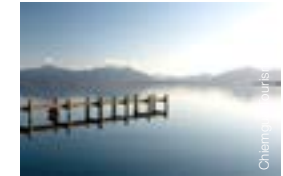
5 Chiemsee The "Bavarian Sea": beach, islands and more. Only 20 minutes away