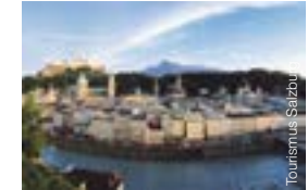
8 Salzburg World heritage site and festival city – just 1 hour away by train