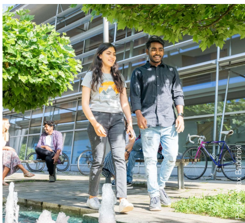
3 ECTS CP

Ask for Erasmus+ funding at your International Office